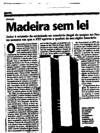
The mahogany business has also been linked to political corruption, money laundering, death threats and murder.

Realizing the scale of the problem, in October 2001 the Brazilian government temporarily suspended all logging, transport and exports of mahogany, pending a full investigation into rampant illegalities in the industry. 119 In early December following the investigation, the Brazilian government announced it would suspend all mahogany forest management plans in the Amazon and take measures to protect Indian lands and conservation areas. The Brazilian government excluded those mahogany management plans which are in the process of being independently certified as coming from well-managed forestry operations. In addition, the government made certification mandatory for all management plans which surround Indian lands and conservation areas. 120