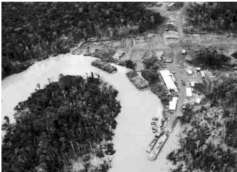
Logs taken from spurring tracks one kilometre or more from a 'road development' project in Papua New Guinea's forest – the project was a ploy for a Malaysian-owned logging company to gain access to valuable timber stocks

In November 2001, the Papua New Guinea government lifted a two-year moratorium on all new logging concessions, despite the damning findings of an independent review. The Papua New Guinea Forestry Review Team, funded by the World Bank and AusAid, had assessed proposed logging concessions and their compliance with Papua New Guinea's laws. They found that one-third of the proposed projects were illegal and almost all were unfit to go ahead in their current form. 51 Out of the concessions found to be illegal, four have nonetheless been given the green light for logging within the largest intact forest areas. Rimbunan Hijau is highly likely to secure significant concessions in these areas.