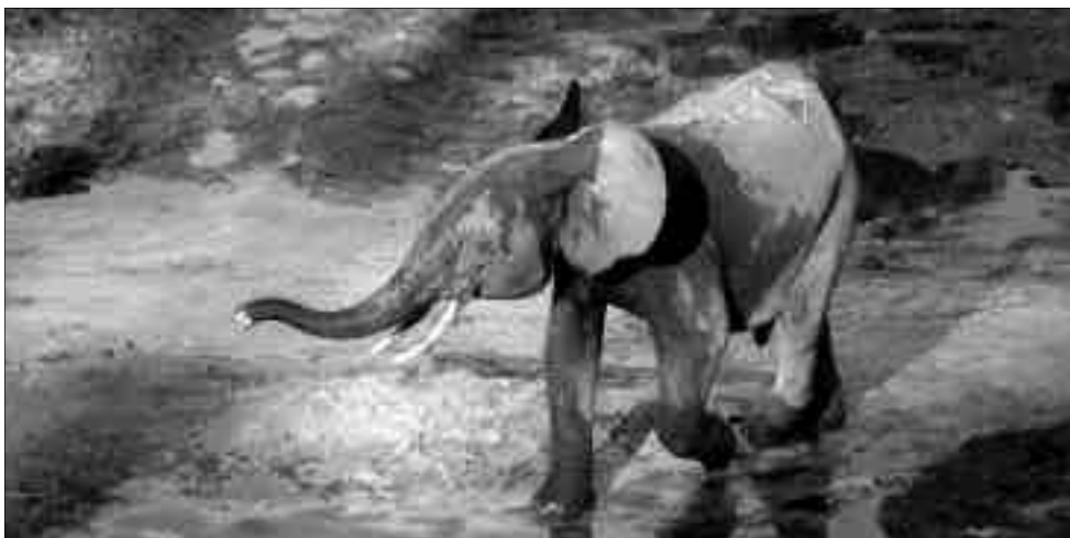
Liberia's threatened forests are the last stronghold of the forest elephant in West Africa

"There is an urgency to take decisive action now. For each year of accepting business as usual, further deforestation and increasing demands on forest goods and services will take humanity further away from the goal of sustainable forest management ... At the global level, in terms of biological diversity and human-induced climate change, business as usual can often only be characterized as short-sighted." Intergovernmental Forum on Forests Fourth Session, 2000 11