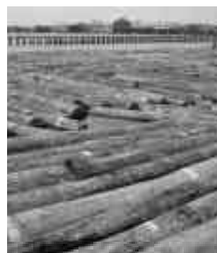
Logs for plywood production in Tokyo harbour

IIED and Papua New Guinea National Research Institute report, 1998 91