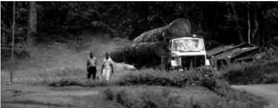
Cameroon's logging industry is dominated by illegalities – to the cost of the forest

Dr. Klaus Toepfer, Executive Director, United Nations Environmental Program, 2001 2