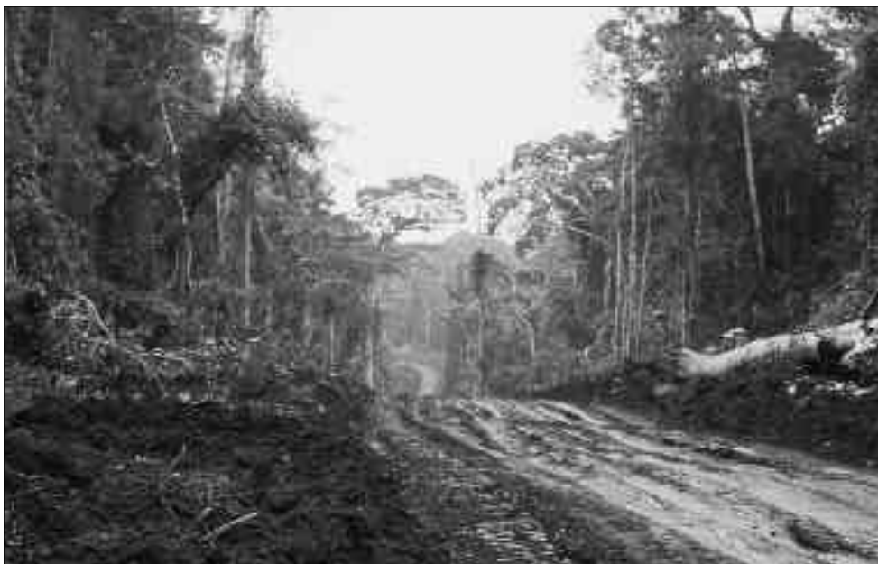
July 2001: new logging road in East Cameroon

"The clock is standing at one minute to midnight for the great apes. Some estimates expect that in as little as five to 10 years they will be extinct across most of their range." Dr. Klaus Toepfer, Executive Director, UNEP, 2000 77