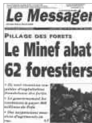
Cameroonian government some of the largest logging companies in the region for illegal logging

DLH Nordisk is one of the world's largest international timber traders and has been linked to forest crime in Central and West Africa and Brazil. For example, its trade links with Liberian logging companies implicated in arms trafficking were exposed by Greenpeace in July 2001. 126 It is also the largest trader of Brazilian mahogany in the international market, controlling up to 50% of the total trade. 127