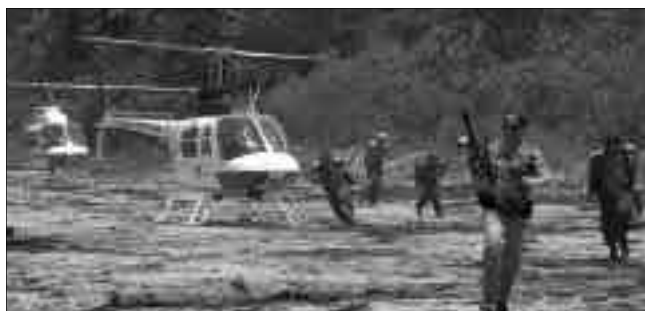
IBAMA seized some 21,000m 3 of illegal mahogany during Operation Mahogany between October and December 2001

"In fact, timber extraction in the Amazon is predominantly (97%) done without management due to poor enforcement, low technological availability, and high economic returns." The World Bank report, 2000 67