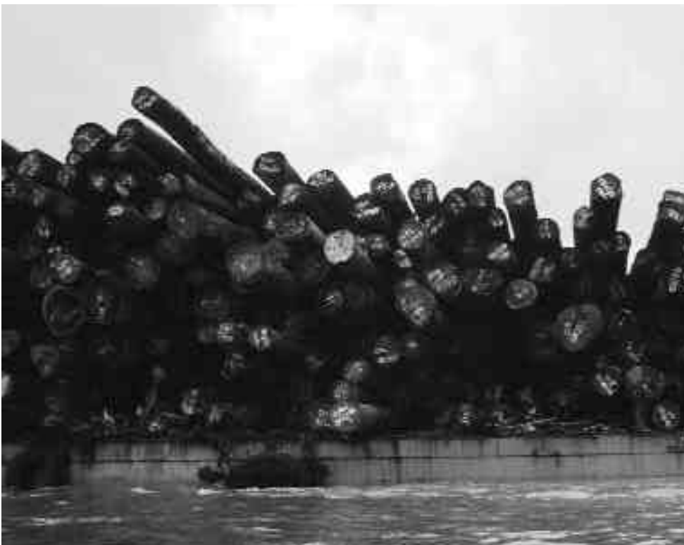
Concord Pacific logs in a Papua New Guinea harbour destined for export to either Japan or China – Concord Pacific's Kiunga-Aiambak 'road development' project is a blatant example of how governments are failing to protect ancient forests by cleaning up the timber trade.

Given Japan's crucial role in the market for ancient forest products, the Japanese government, Japanese companies and consumers all have a special responsibility to work to protect ancient forests from destruction.